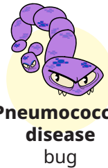
Pneumococcal disease bug